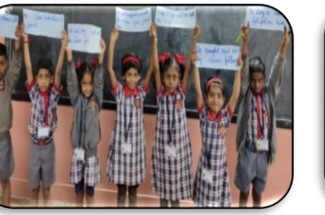
Sequencing the story using flashcards