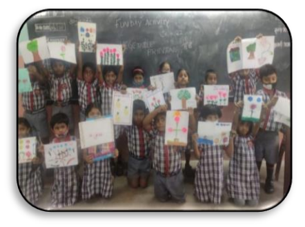
Vegetable printing by II B