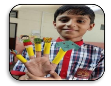
Finger puppets by Jalaj Yadav IV-A