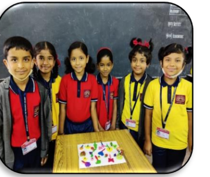
Clay modelling by III B